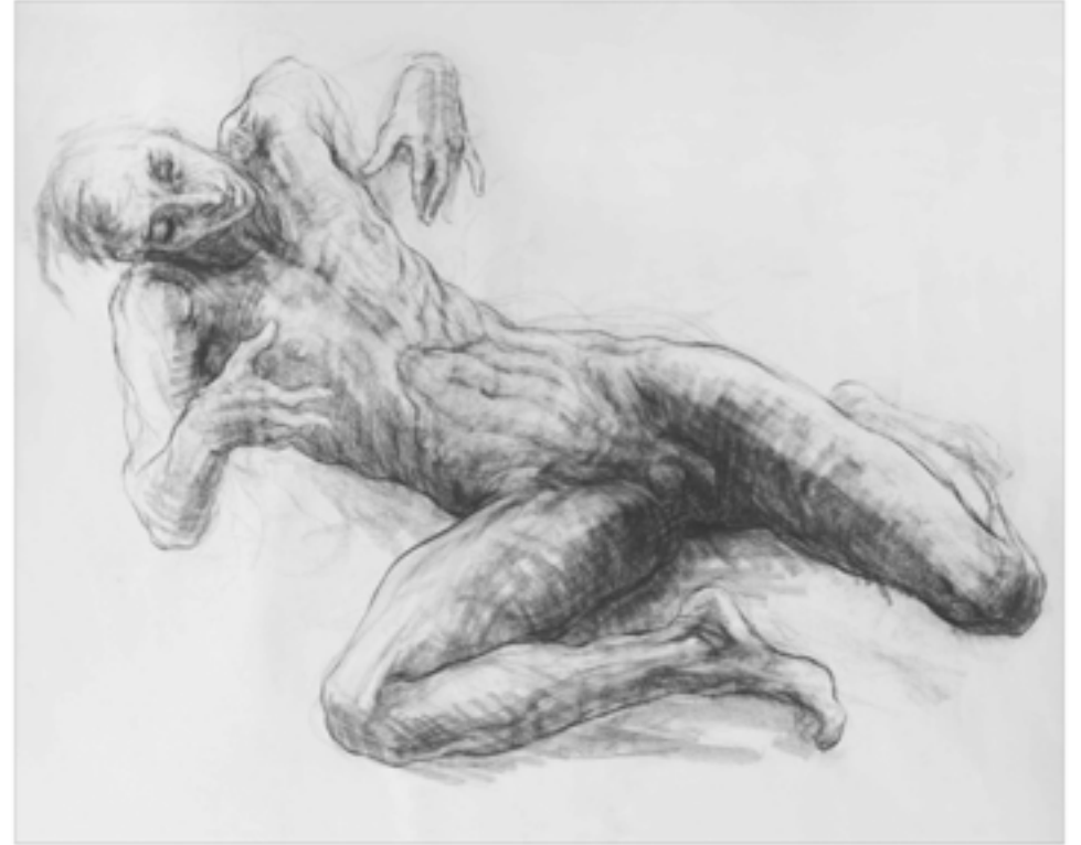
ARI SOFT , 120 by 148 cm - Siberian Charcoal on Paper, 2016