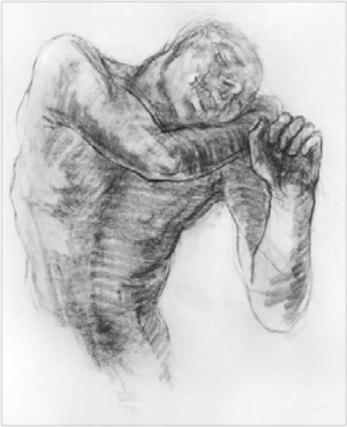
JUST A MOMENT, 79 by 78 cm - Siberian Charcoal on Paper, 2014