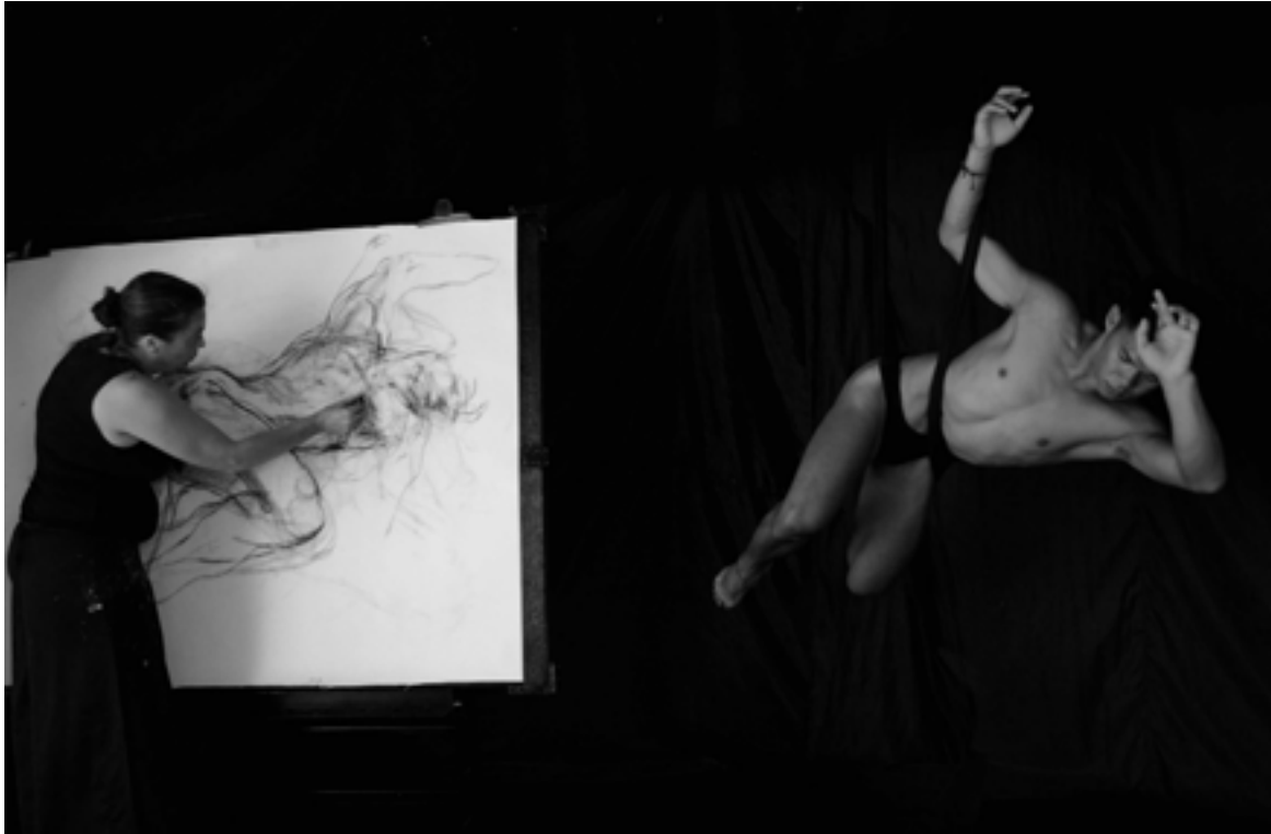
LINES OF LIGHTNESS, Dance Film, 2017