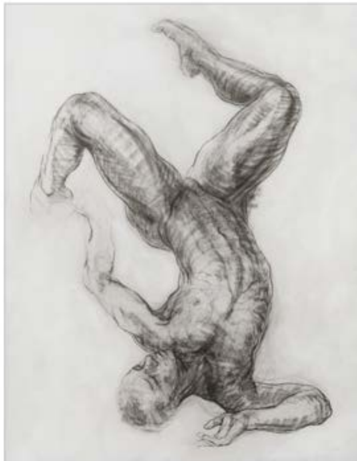
HANGING, 148 by 115 cm, Siberian charcoal on paper, 2017