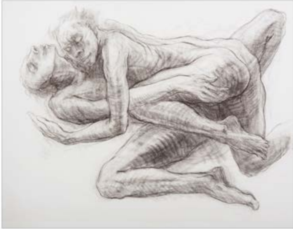
ARI DOUBLE LOVE , 115 by 146 cm - Siberian Charcoal on Paper, 2016