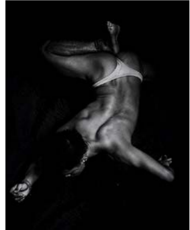
Dance Film, 2017