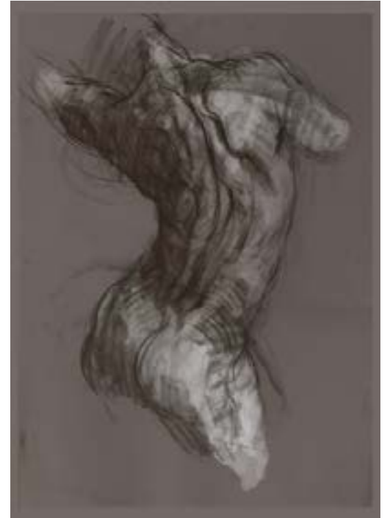
Digital Drawings, 2018