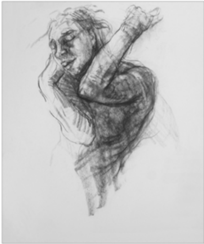
DAYU PORTRAIT, 87 by 71cm - Siberian Charcoal on Paper, 2014