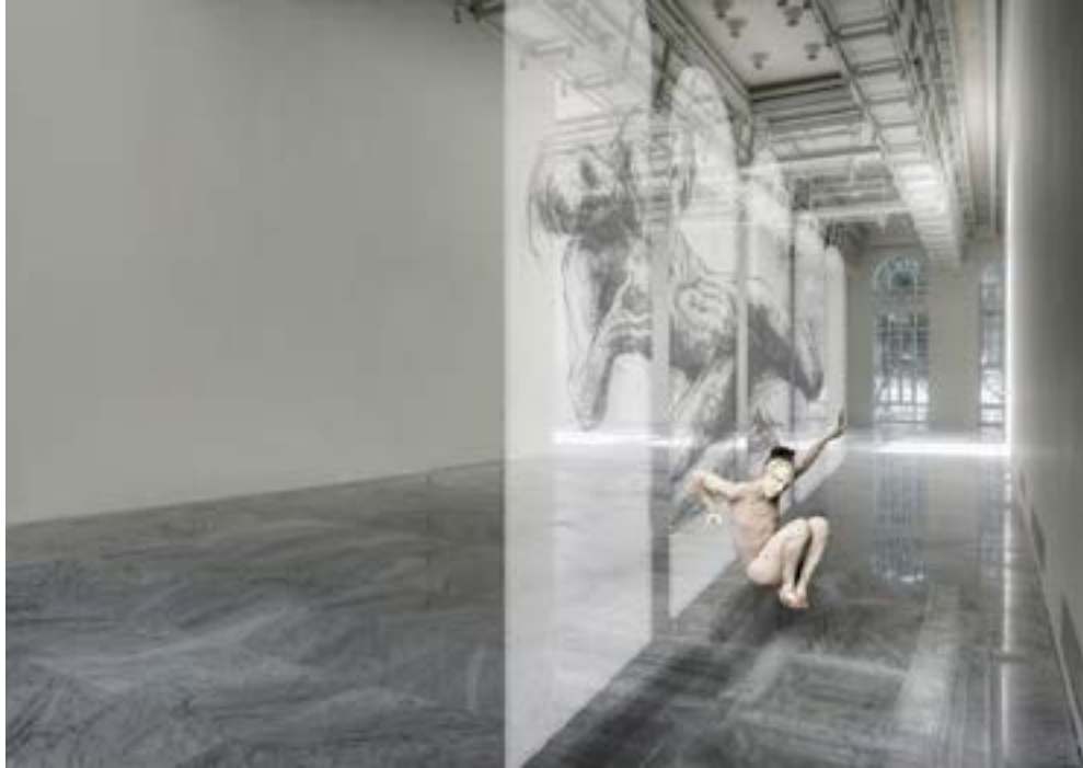
REVERBERATION, Faena Building - Argentina, 2016