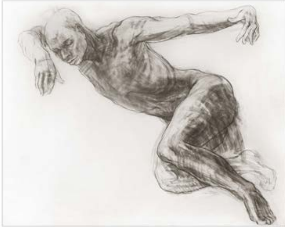
ANGEL, 118 by 147 cm - Siberian Charcoal on Paper, 2015