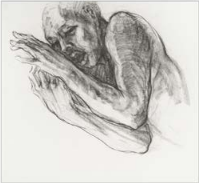
INTIMACY, 70 by 76 cm - Siberian Charcoal on Paper, 2014