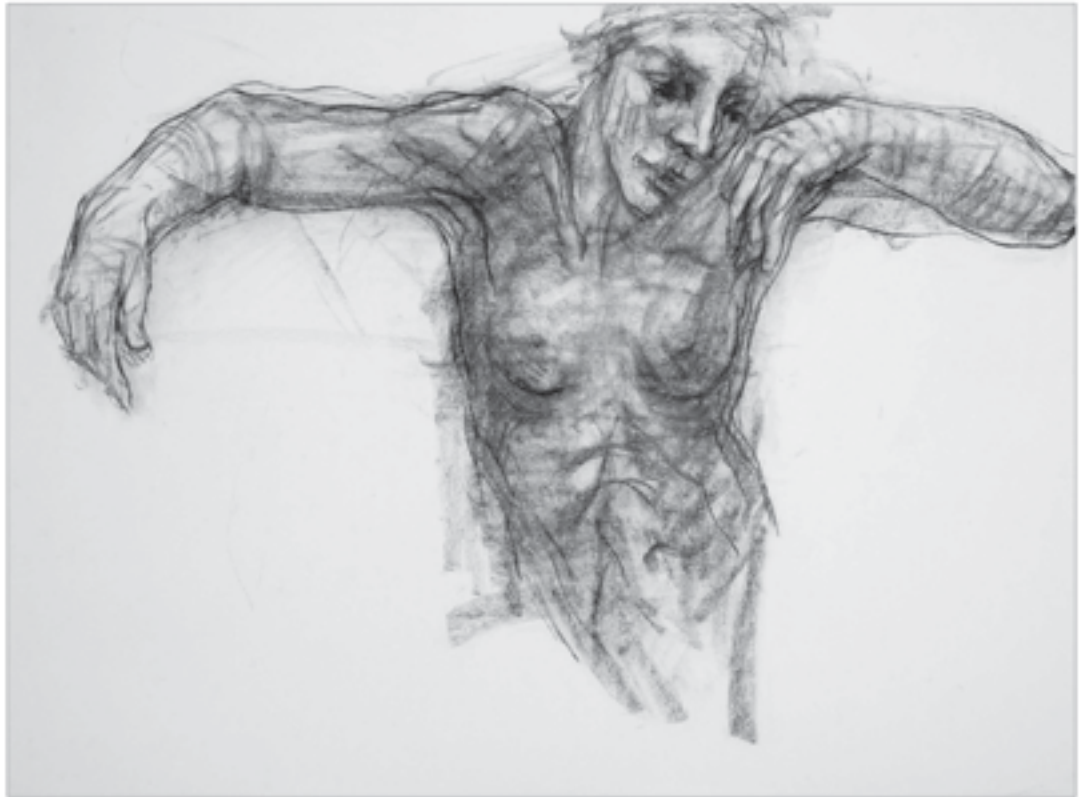
SWAN, 80 by 110 cm - Siberian Charcoal on Paper, 2014