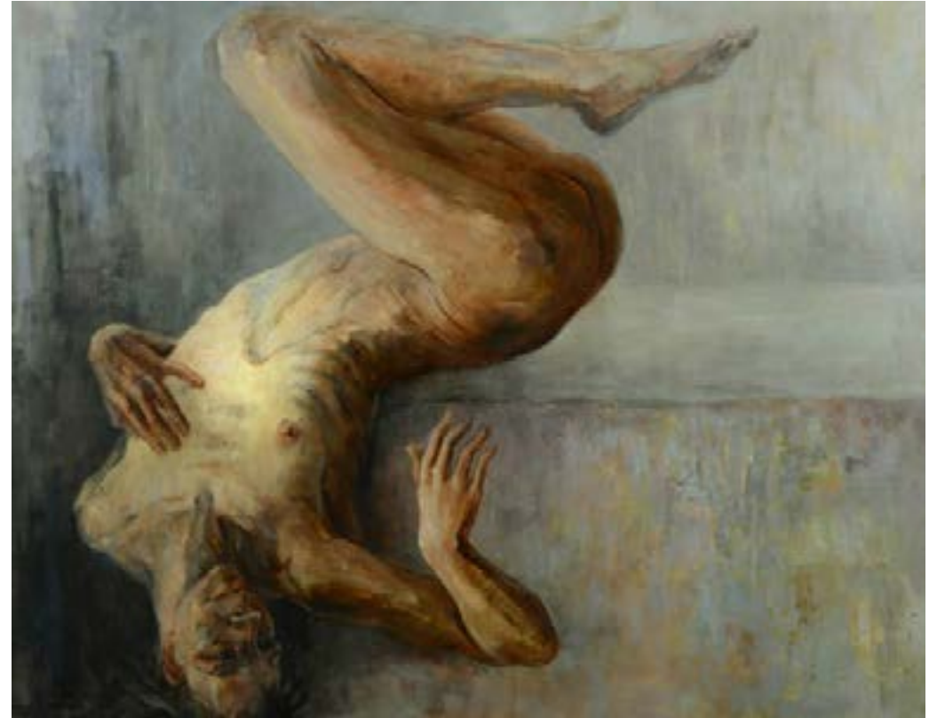
WATERFALL, 120 by 139 cm, oil on panel, 2015