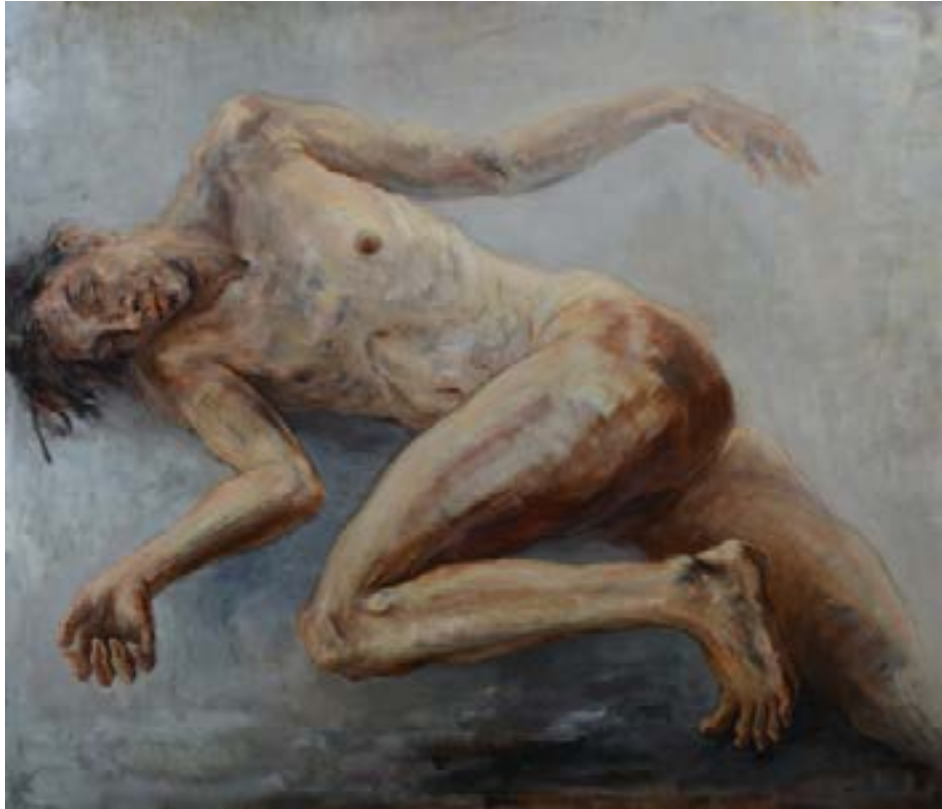
ARI, 120 by 139 cm, oil on panel, 2015