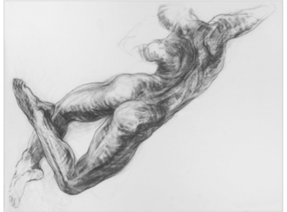
JUICY, 113 by 150 cm, Siberian charcoal on paper, 2017