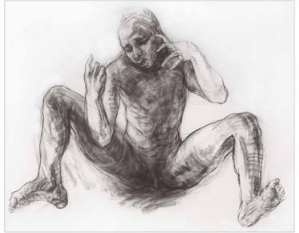
BABY, 117 by 148 cm - Siberian Charcoal on Paper, 2015