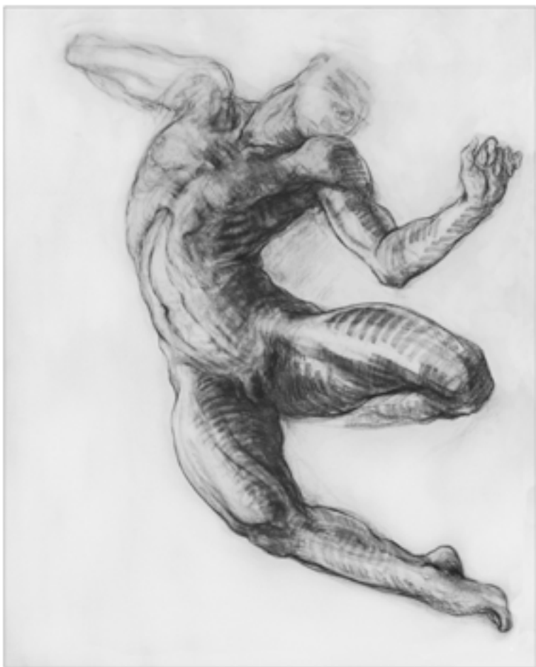
BEACH WALK, 147 by 115 cm, Siberian charcoal on paper, 2017