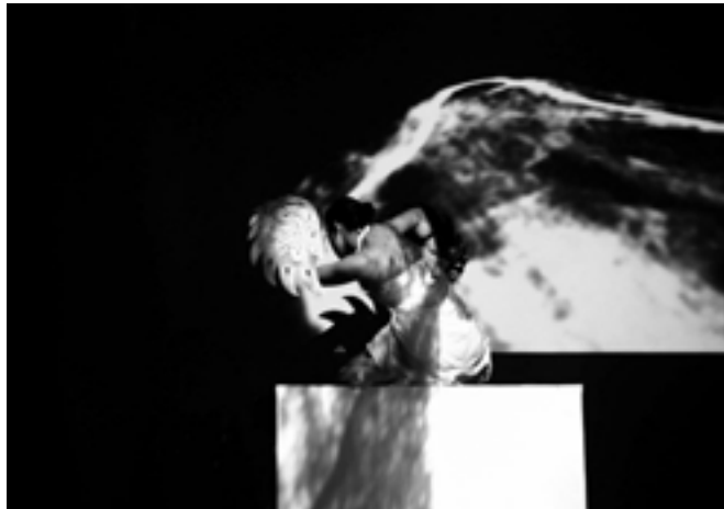
GRAY LINES, Dance Project, 2014