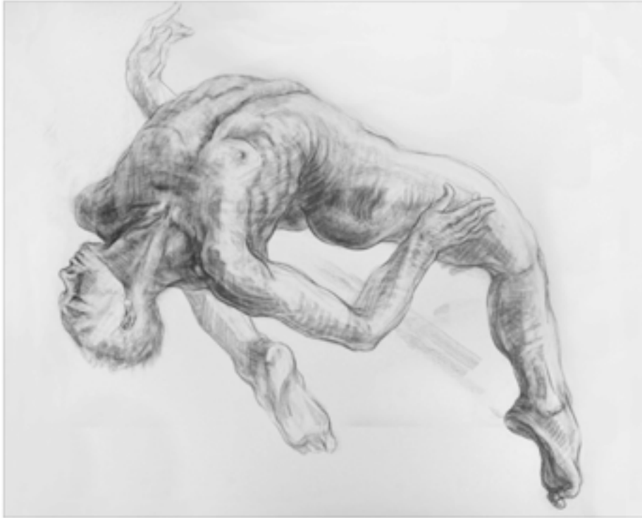
BRIDGE, 118 by 142 cm, Siberian charcoal on paper, 2017